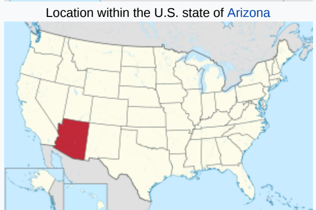
Arizona's location within the U.S.