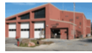
Station 23 Oak View