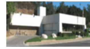
Station 30 Civic Center