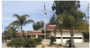
Station 36 Oak Park