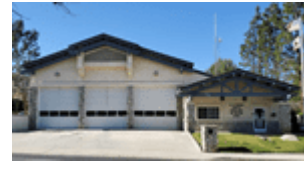
Station 40 Mountain Meadows