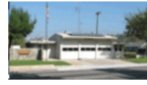
Station 34 Arboles