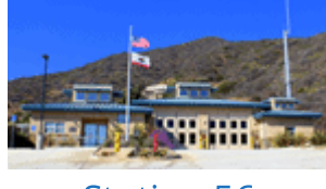
Station 56 Malibu