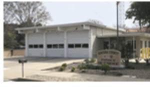
Station 32 Portrero