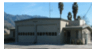
Station 22 Meiners Oaks