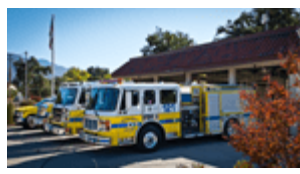
Station 21 Ojai