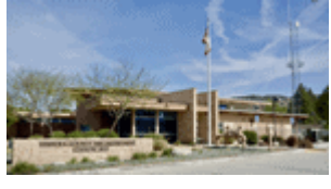
Station 43 Yosemite