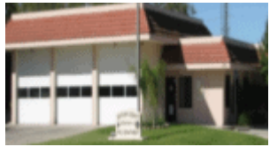
Station 31 Westlake