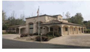
Station 37 North Ranch