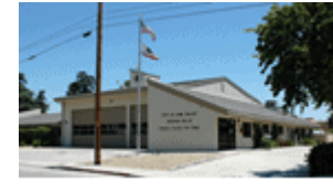
Station 41 Simi Valley