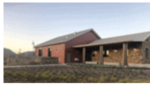
Station 27 Fillmore