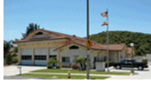
Station 44 Wood Ranch