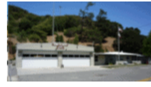
Station 33 Lake Sherwood