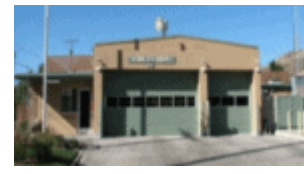
Station 28 Piru