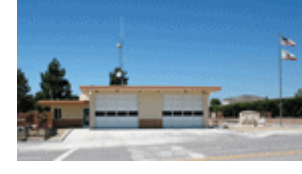
Station 46 Tapo