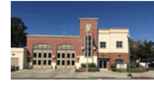
Station 42 Moorpark