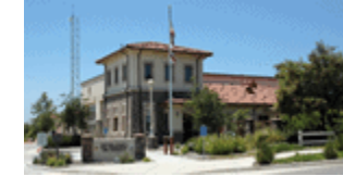
Station 47 Big Sky