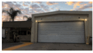
Station 26 West Santa Paula