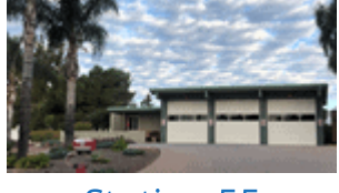
Station 55 Las Posas