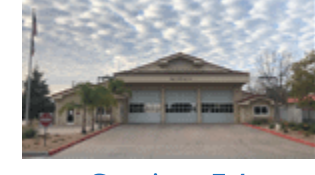
Station 54 Camarillo