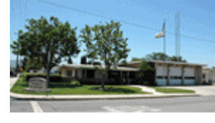
Station 45 West Simi