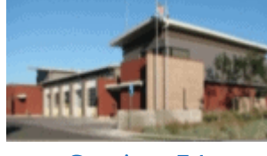
Station 51 El Rio