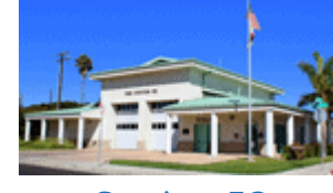
Station 53 Port Hueneme