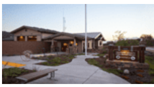
Station 20 Summit