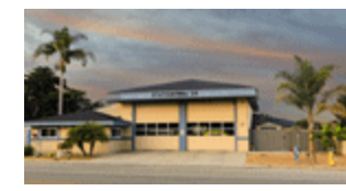
Station 25 Rincon