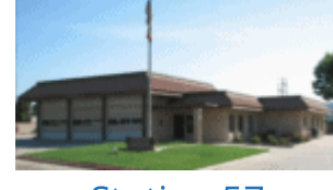
Station 57 Somis