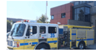
Station 35 Newbury Park