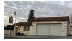
Station 29 Santa Paula