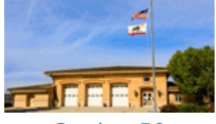
Station 50 Camarillo Airport