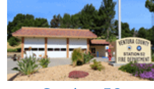
Station 52 Mission Oaks