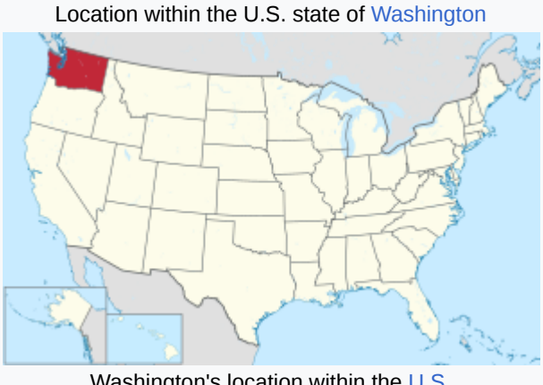
Washington's location within the U.S Coordinates: 🥥 48°34′N 122°58′W