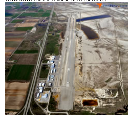
Photo taken 19-Apr-2011 looking north.

WARNING: Photo may not be current or correct