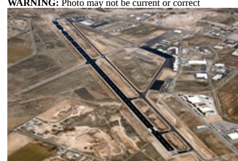
Photo taken 09-Dec-2015 looking north.

WARNING: Photo may not be current or correct