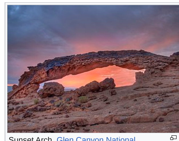
Sunset Arch, Glen Canyon National Recreation Area